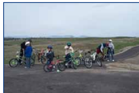
During the month of February, children at Wymore-Blue Springs spent nearly 1,100 hours being physically active instead of watching television or using computers and video games.

Encouragement activities were successful in raising awareness and shifting attitudes on walking and bicycling to school and physical activity. One-third of parents reported on surveys at the end of the year that their child’s school strongly encourages walking and bicycling to school, an increase from 19 percent at the beginning of the year.